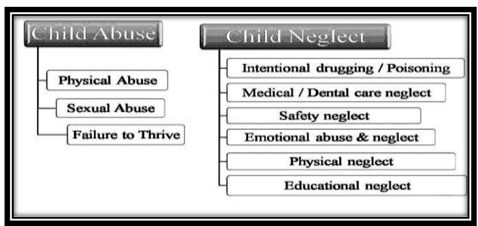
Fig2. Schmitt's Classification of child abuse and neglect<sup>6</sup>

Volume 6, Issue 1 Jan-Feb 2021, pp: 259-263 www.ijprajournal.com ISSN: 2249-7781